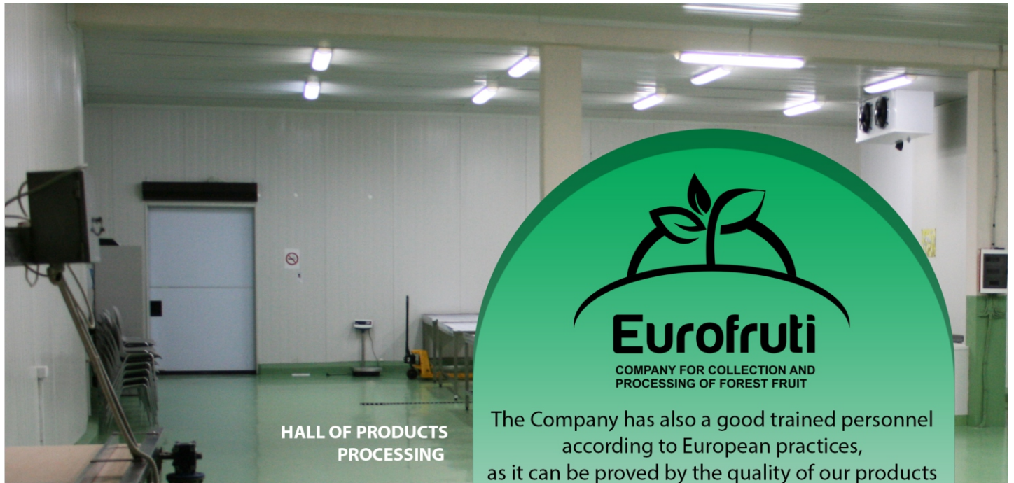
HALL OF PRODUCTS PROCESSING