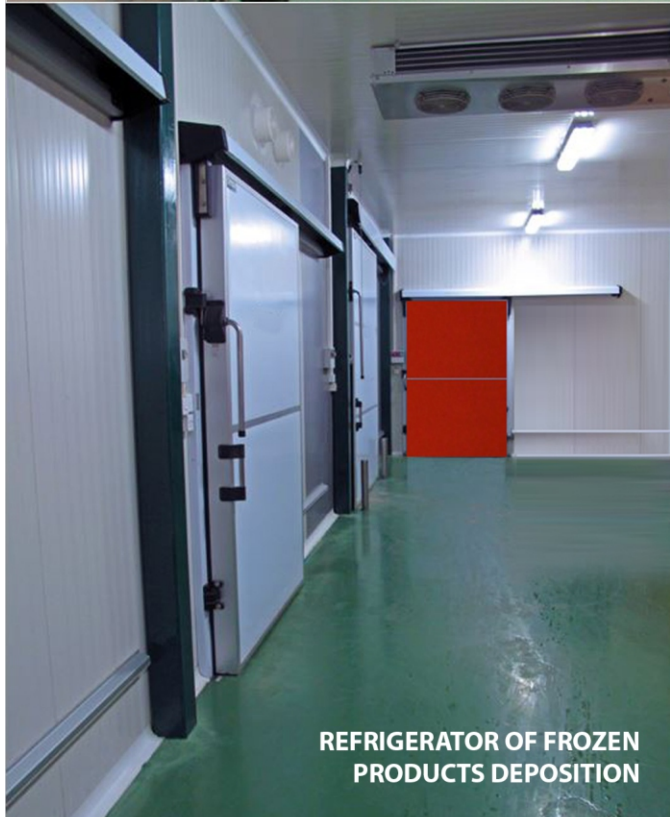
REFRIGERATOR OF FROZEN PRODUCTS DEPOSITION

The Company has also a good trained personnel according to European practices, as it can be proved by the quality of our products